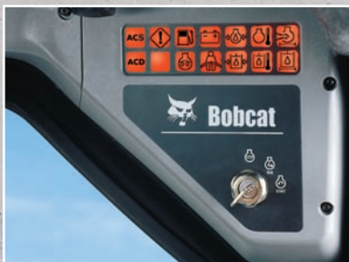
Right Side Instrument Panel