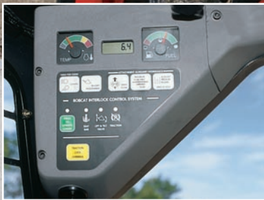
Left Side Instrument Panel