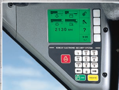
Optional Deluxe Instrument Panel